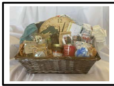
#13 Michigan Made Basket Variety of Michigan Made Products Donated by: A Little Something Value: $300