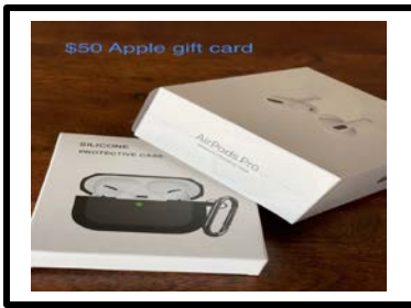
#12 Apple Lover's Delight Airpods and $50 Apple GC Donated by: The Schweihofer and VitoCruz Families Value: $350