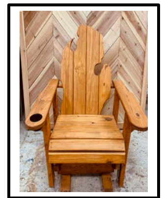
#14 Michigan Glider Chair Donated by: Tiki Republic Value: $300