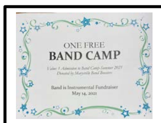
#20 Band Camp Membership All Expenses Paid for the 2021 Camp Year Donated by: Marysville Band Boosters Value: $325