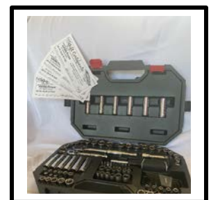
#18 The Mechanical Man Husky 94 Piece Mechanics Tool Set and 4-$25 Good Year Tire and Auto GC Donated by: Home Depot and Good Year Tire and Auto Value: $170