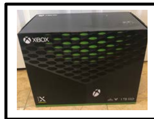
#17 Xbox Series X Donated by: QCS Value: $500