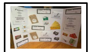
#22 Gift Card Board Numerous Gift Cards from the Blue Water Area Donated by: Band Families & Local Businesses Value: $725